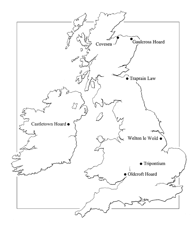
Fig. 5 — Location of the principal sites and finds discussed in the text. Map by James Farrant; © The British Museum 2005.

the plate's rim and enlargement and reduction of the beads this pin looks forward to the full hand type. The head is slightly smaller than on the Oldcroft example.